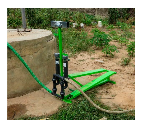
BASILEA-pedalpump suction and pressure pump