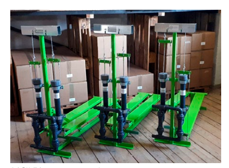
BASILEA pumps at stock

For several years the local staff of the NGO «ReachAcross» trains former nomads in irrigation with pedalpumps to increase agricultural production. PEPOPU ensures continuation of this ongoing process by sending BASILEA pumps to Djibouti.