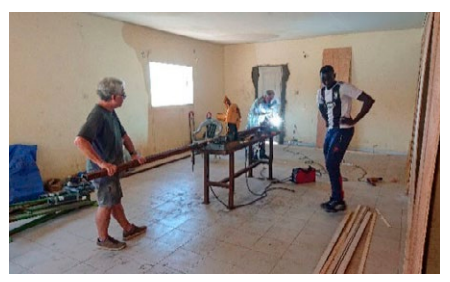
Setting up a workshop