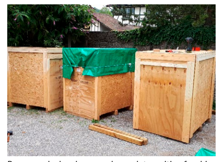
Pumps packed and prepared on palets, waiting for shipping