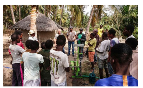
Swisscontact and PEPOPU demonstrating the pump to local farmers

With the support of the project Horti-Sempre, provided by swisscontact in Nampula, we introduced the BASILEA-pedalpump and BASILEA-handpump in different communities and signed a convention to produce the pumps at the technical college in Nampula.