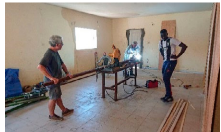
Setting up a workshop