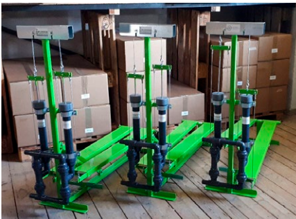
BASILEA pumps at stock

For several years the local staff of the NGO «ReachAcross» trains former nomads in irrigation with pedalpumps to increase agricultural production. PEPOPU ensures continuation of this ongoing process by sending BASILEA pumps to Djibouti.