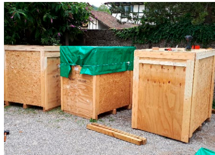
Pumps packed and prepared on palets, waiting for shipping