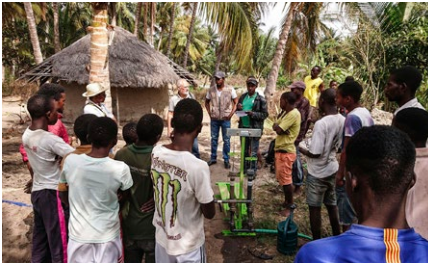
Swisscontact and PEPOPU demonstrating the pump to local farmers

With the support of the project Horti-Sempre, provided by swisscontact in Nampula, we introduced the BASILEA-pedalpump and BASILEA-handpump in different communities and signed a convention to produce the pumps at the technical college in Nampula.